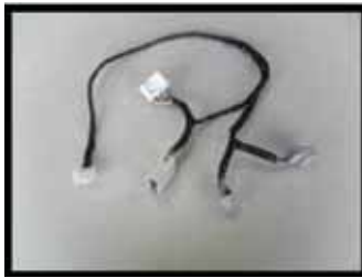
Radio Short Harness