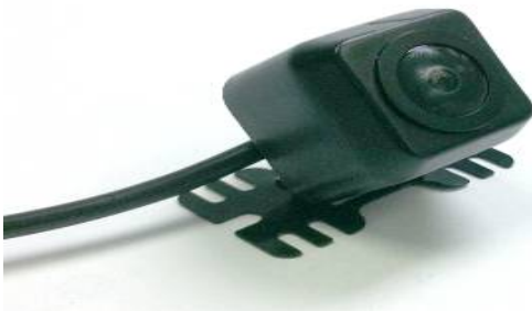
Alternate Camera Mount Bracket

Place camera in desired position to confirm fitment (Note: Some states prohibit items blocking the license plate; check local authorities to confirm legal status for your application).