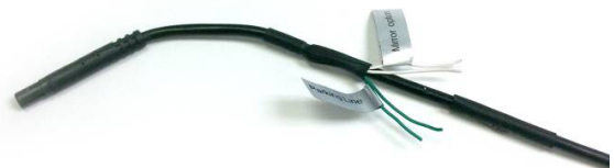
Green and White wires on the Camera Harness

Display options: Default setting is mirror image display (i.e., words and letters appear backwards as in a mirror) for rearward facing camera (rear view) installation. To change to forward facing camera (front view), connect the two white wires near the end of the camera harness.